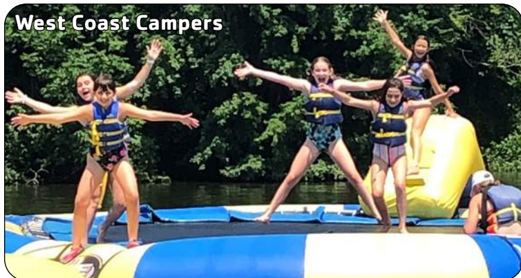
West Coast Campers